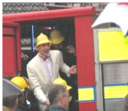
Photos: Year 11 arrive at the Prom.